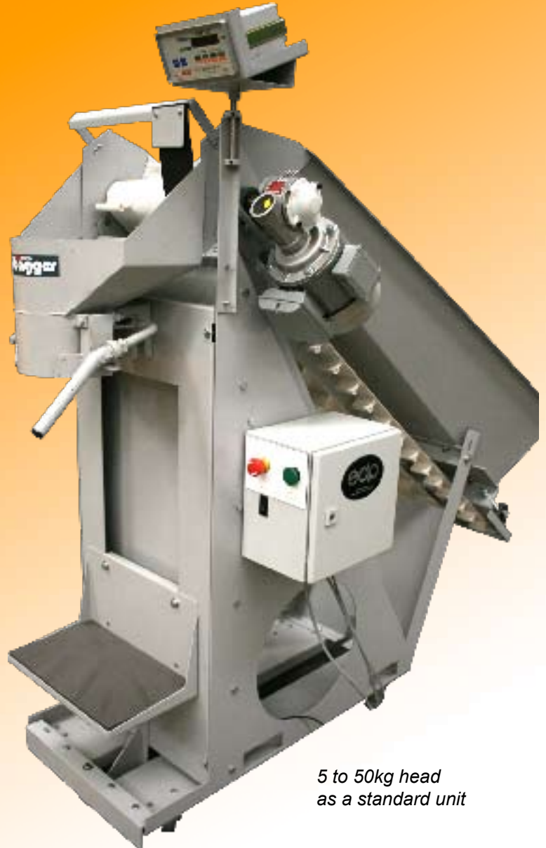
5 to 50kg head as a standard unit

With 60 years in the Fruit and Vegetables industry we have the expertise and experience to give you, our valued customer, the best and most reliable equipment economically possible