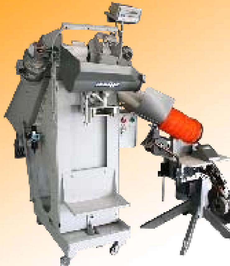
Illustrated with automatic tilt pan and net bagger

Large produce head Manual or automatic tilt pan