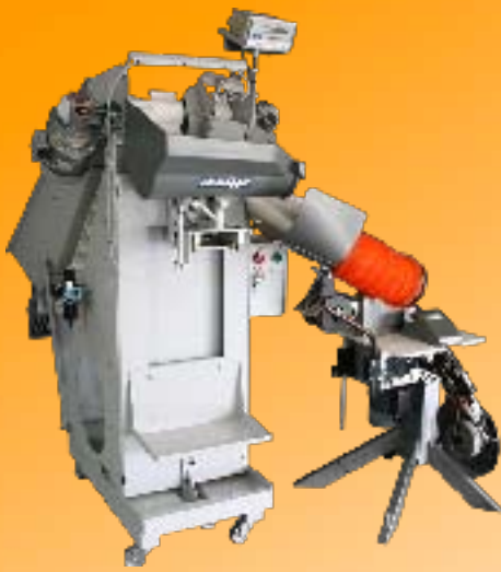
Illustrated with automatic tilt pan